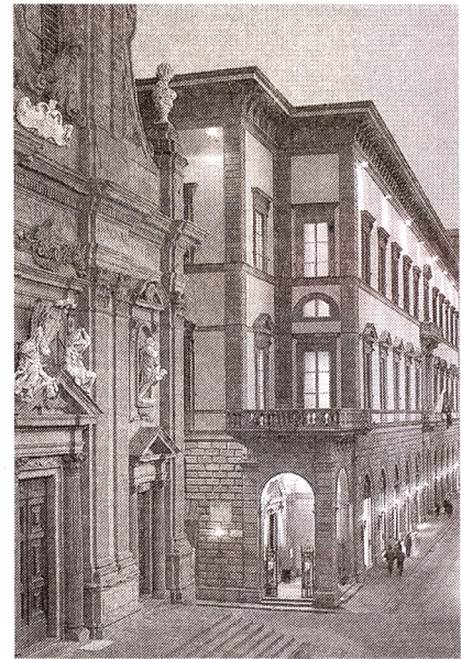
PHOTOGRAPHS ABOVE, PALAZZO TORNABUONI; PHOTOGRAPHS BELOW, BORGO DI VAGLI

Among the new fractional ownership properties popping up in Europe are the Palazzo Tornabuoni, above, a former Medici palace in Florence, Italy, and Borgo di Vagli, below, a restored 14th-century hamlet in the Tuscan hillside.